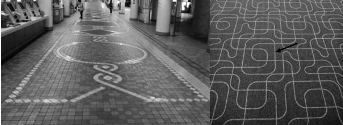
Fig. 12. Left: The underground passage of Sannomiya city, Hyogo pref. Right: The carpet of the internal (No. 1) terminal floor of Tokyo Haneda airport. There is free style lines and only one loop in this area.