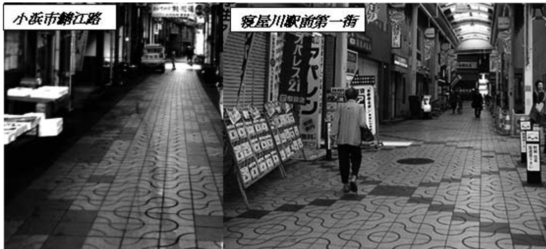
Fig. 13. Left: The Saba-Kaido (Mackerel road) front of the Museum, Obama city, Fukui pref. Right: Neyagawa city, Osaka. These tiles consist of the same two-quarter-circles, but in different arrangements to form two different patterns (refer Fig. 24).